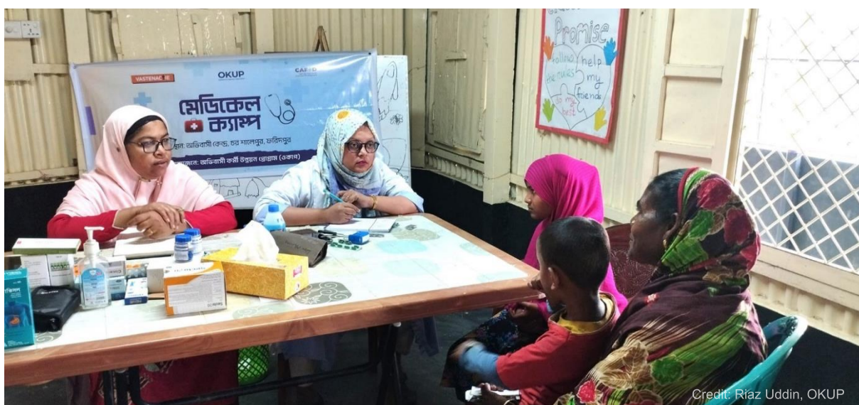
Children, women, and elderly men receive prescriptions and basic medicines from an expert doctor at the OKUP health camp

Being located on a riverbed island, and having no public or private healthcare facility in the Charsalepur Union, the people need to go to the district/sub-district Headquarters for healthcare services. A number of children reported that they were not brought to the doctors even when they were suffering from critical illness. Rather, they were given treatment by the quack doctor in the village. In this context, OKUP introduced organizing a 'Health Camp' in 2023 to create opportunity for the poor people and the children to visit doctors. Some 10 health camps were organized during the time period by doctors specialized on child health, women health and general medicine. 430 patients including children, women and elderly man received 'treatment advice' with prescriptions for medicine by the visiting doctors.