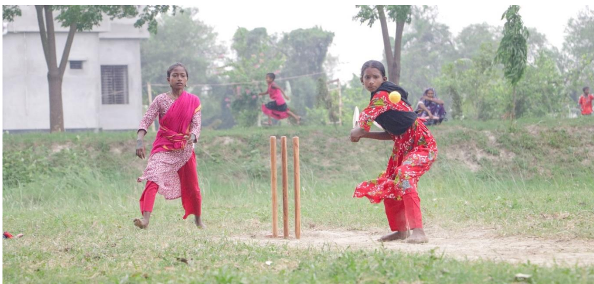
A Cricket Competition for the girl group of the child club.